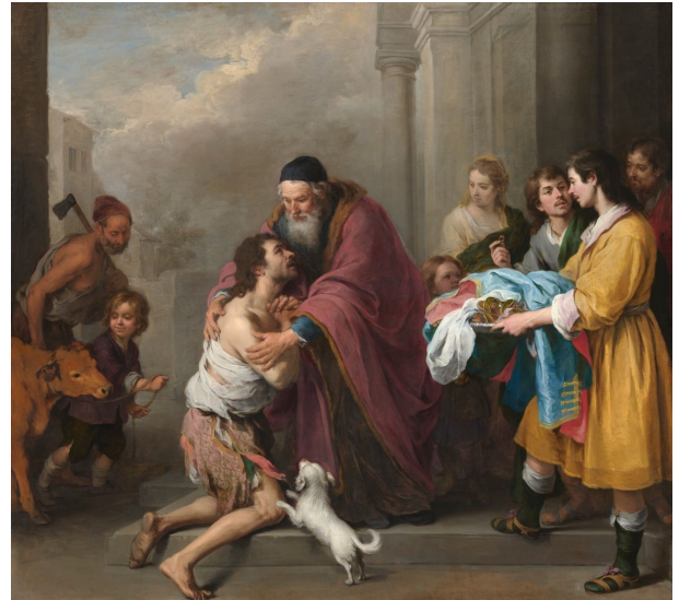
(The Return of the Prodigal Son, 1667/1670, Spain—Bartolomé Esteban Murillo)

The Rite of Reconciliation begins with the sign of the Cross, a reminder that we are baptised into the Family of the Father, Son and Holy Spirit, and that we are saved by the outpouring of Divine Love in the mystery of the Cross.